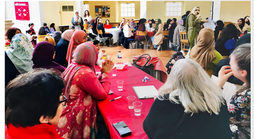
First International Women's Day celebration by Women100 in 2018, in St George's in the East Church in Shadwell. 102 people attended and shown their interest to continue to develop Women100 and women leadership in the borough.