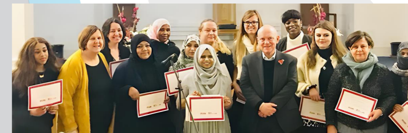
Recognition from former Mayor of Tower Hamlets John Biggs. since we started more than 250 women were trained in community organising and leadership by women 100, some of the women recognised by the Mayor of Tower Hamlets.