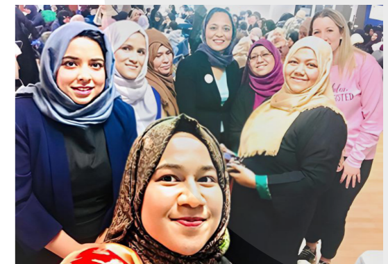
Women100 won the most innovative award by TELCO Citizens in 2019.