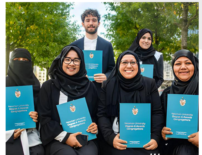
Women100 community Organising and leadership graduation ceremony at Newman University, Birmingham- we have 10 leaders went to do a course on community organising and leadership, and graduated from Newman University in 2021.