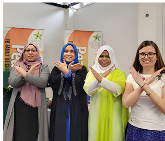
International Women's Day 2022 at Dawatul Ummah. Celebrating those women who broke many barriers and achieved so much for their communities.

from Citizens UK alliance initiated the programme, founding members are the East London Mosque, St Georges in the East Church, Muslimat London, E1 community Church, Queen Mary, University of London, The Theology Centre and Tower Hamlets Citizens.