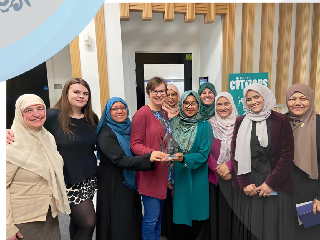
Women100 received the most innovative leadership of the year by TELCO Citizens in 2019.