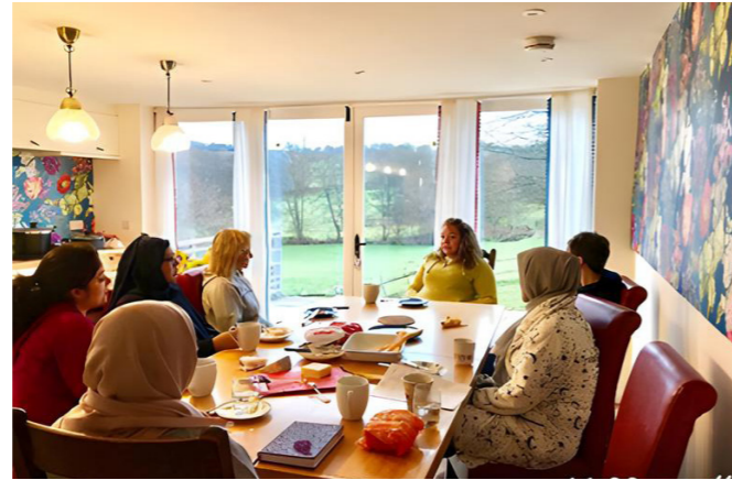
Silent retreat 2019. Four Muslim leaders and four Christian leaders from Women100 went for a retreat to reflect and reconnect with their purpose of fighting for justice and how their faith motivates them to social justice.