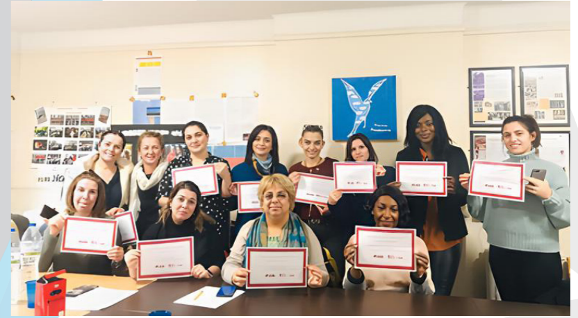
Women100 training in Newham, 12 leaders from Spresha programme completed Women100 leadership training. Spresha Programme aims to develop Albanian and other Eastern European communities in Newham using Community organising leadership training by Citizens UK.